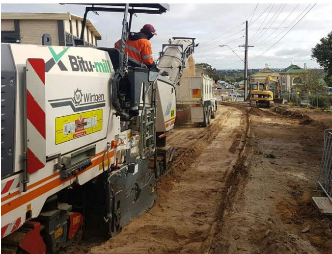
A profiling machine removes the existing pavement in Zone 5

The Revitalisation of Sixth Street is now underway. The team from 'Outside Ideas' have removed the existing road pavements in Zone 1 (the Southern end adjacent to Mitre 10 and the Marketplace) and Zone 5 (the Northern end between Fourth Street and Fifth Street), in preparation for the new stormwater drainage and pavements to be constructed.