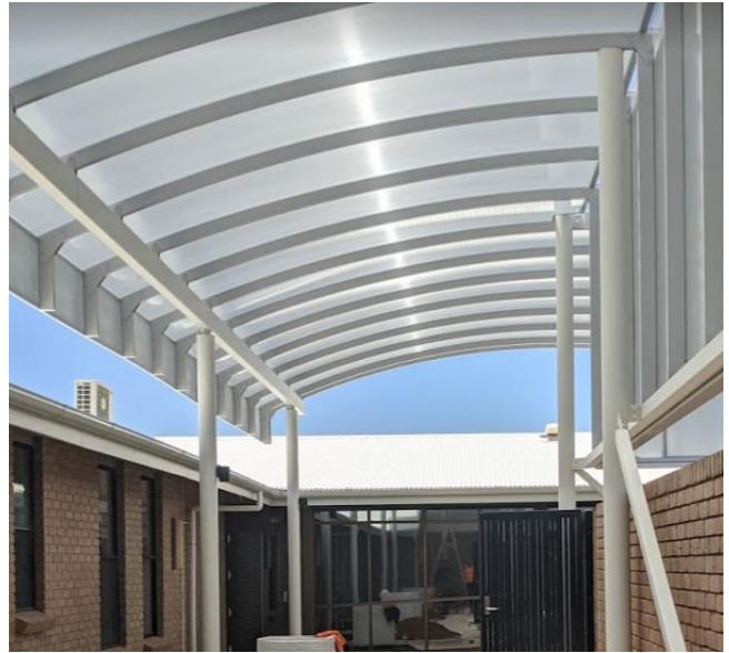
New cover for courtyard

The new year will bring, the completion of the fish pond, installation of plants for the new planter boxes in the courtyards and new signage.