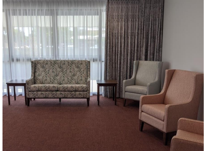
New and refurbished common areas and new furnishings