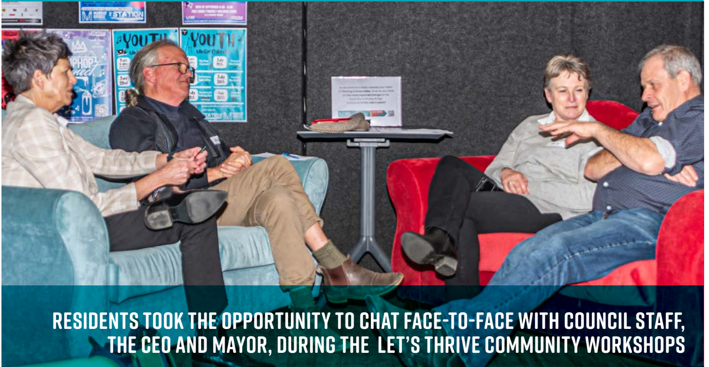
RESIDENTS TOOK THE OPPORTUNITY TO CHAT FACE-TO-FACE WITH COUNCIL STAFF, THE CEO AND MAYOR, DURING THE LET'S THRIVE COMMUNITY WORKSHOPS

CONVERSATIONS with community to determine Council's priorities for the next four years have generated some exciting ideas and a lot to think about as part of the Let's Thrive consultation.