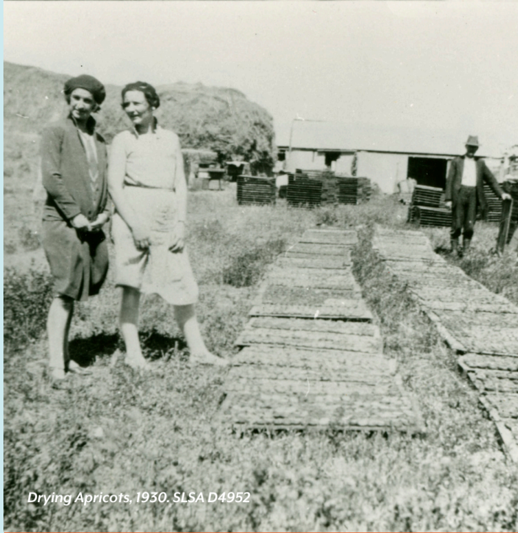
Drying Apricots, 1930. SLSA D4952