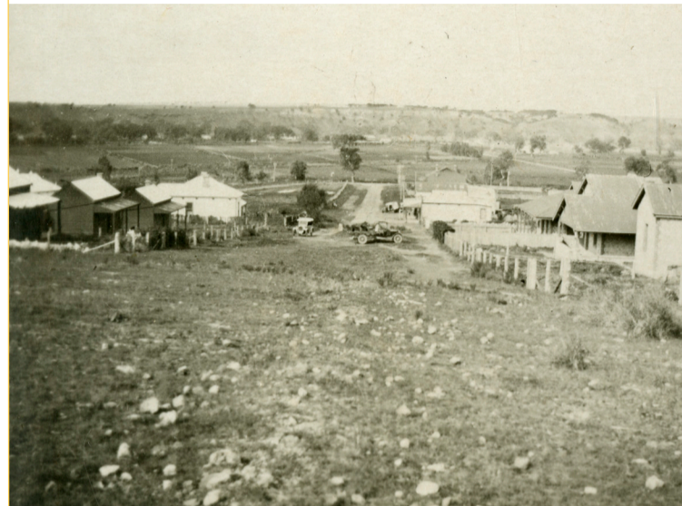
Mypolonga School during flood, 1956. Mypolonga Primary School

From the school, continue up Williams Street and turn left at the intersection onto Marten Street. At the intersection, look back down the street and compare the view with the photograph below, from 1925. Continue down Marten Street until you reach the next intersection. Turn right to end up back on Green Street. Continue up Green Street until you reach the Institute