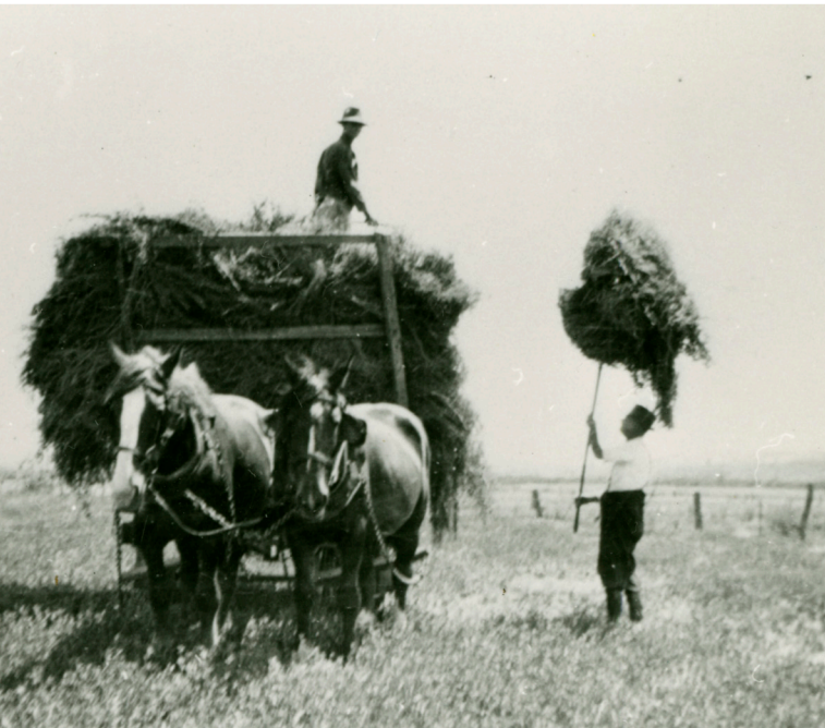
Carting Hay, 1930.

Walk down the hill. Cross over Marten Street and continue until you come to the park on your right-hand side.