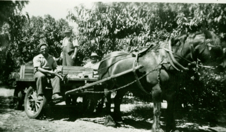
Fruit Pickers, 1930. SLSA D4952

With the institute in front of you, turn left and walk to the end of Green Street until you reach the second sign.