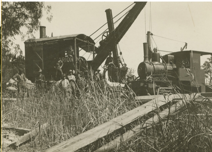
Steam navy & locomotive used for construction work, 1915. PRG-1258-59-210

To continue on the Discovery Trail, with the park behind you, turn left into Hannaford Terrace and walk two blocks until you reach Williams Street. Turn left and walk up Williams Street to the general store.